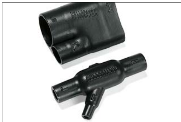
1303-1-G supplied / fully recovered.