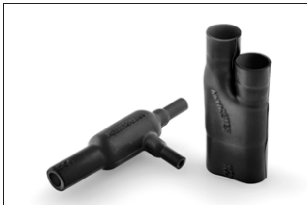
1204-1 supplied / fully recovered.